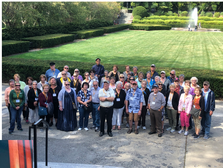
Right is NYC Central Park