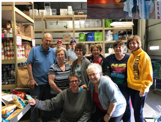
PACE-Setters volunteering at the Community Pantry of Pulaski