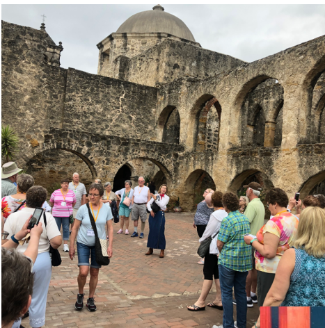
Left is San Antonio