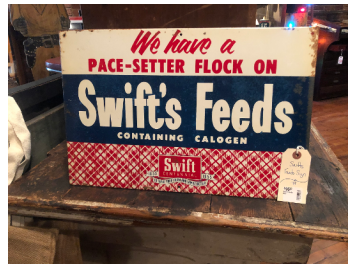
Above Our own sign in the American Pickers Store