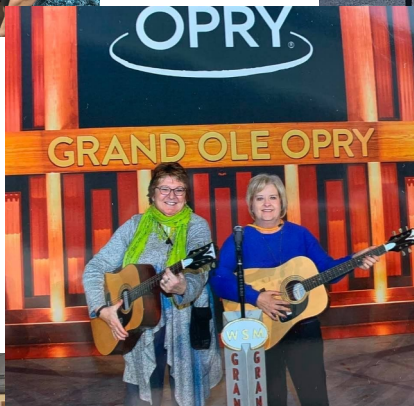
Right We can carry along our own musicians to Nashville