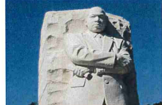
Martin Luther King, Jr. National Memorial