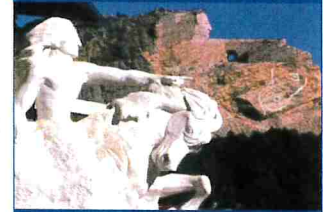
Crazy Horse Monument to be 10x the size of Mt. Rushmore