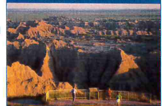
Spectacular Badlands National Park