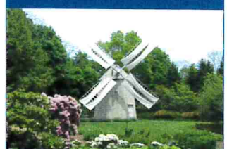
One of Cape Cod's many Windmills