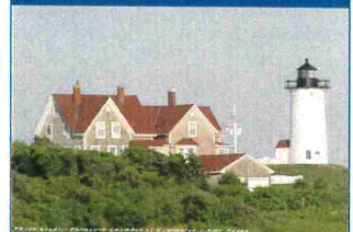
Lighthouse overlooking Vineyard Sound