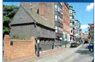
Experience 17th century history in Plymouth, MA